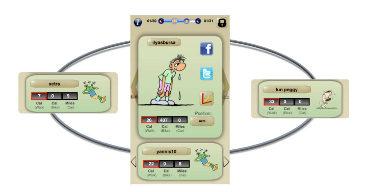
Figure 2: iBurnCalorie app Extension.

the avatar walks. When the user does not walk, the avatar 'sleeps'. The number of walking calories spent thus far in the day is shown below the avatar.