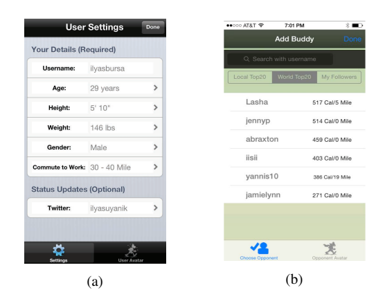
Figure 1: iBurnCalorie: (a) registration and (b) the buddy selection screen.

At first launch, the user sees a registration screen, where s/he enters her/his preferred username and some profile information needed for the caloric calculation and subsequent data analysis. This information includes the user's gender, age, weight, and height (Figure 1a). After the login and registration process, the user by default follows a virtual or statistical user called 'World Average', a statistic computed by the application. At the user's discretion, through the buddy selection process described above, this virtual user can be replaced by other statistics like World Top or World Top 5, or another real user (Figure 1b). The application's main screen shows an avatar representing the user (Figure 2). When the user walks,